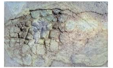
ILSE DREHER »Das Erscheinen der Wirklichkeit«

My installation in Tirana consists of artificial skin, wax and silicone tubes, some of which are filled with colored water. Between the artificial skin and the silicone tubes are superimposed photographic films shrink-wrapped in crystal-clear foil. The photographs are about water, ice, sand, aerial shots and other things from nature. | ID