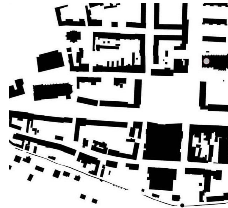
HARALD ETZEMÜLLER »On the rebelliousness of urban spaces«

At tipping points things might or have to change. In such moments of uncertainty looking for truth is crucial for everybody. But we should be aware that many perspectives might be valid and an open mind will be more than helpful. | PH