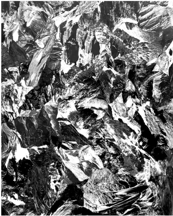
MATTHIAS RUDOLPH »THE BOOK I READ«

Our perception is always an interpretation of reality. So what do we see before our inner eye when this reality is somehow strangely altered? How do we deal with it when our usual patterns of perception don't really fit? In the series of works entitled ›THE BOOK I READ‹, I work with the image motifs of a single book, cutting them up and reassembling them in various shapes and sizes. In my other work, ›DO YOU WANT TO PLAY A GAME‹, I use old photographs from private photo albums and let them interact with statements from international magazines. | MR