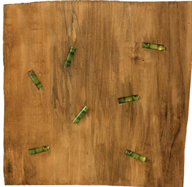
PAUL HIRSCH »same same, but different«

My installation in Tirana consists of artificial skin, wax and silicone tubes, some of which are filled with colored water. Between the artificial skin and the silicone tubes are superimposed photographic films shrink-wrapped in crystal-clear foil. The photographs are about water, ice, sand, aerial shots and other things from nature. | ID